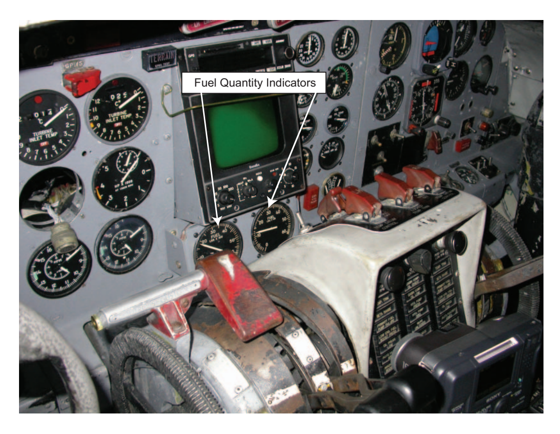
Figure 3. The Convair 580 fuel quantity indicators and center pedestal.

Postaccident interviews with Air Tahoma personnel and an inspection of another Convair 580 revealed that, at some seat positions, it was difficult to see the fuel quantity indicators. Specifically, if the seats were in an aft position, the indicators were difficult to see because the throttle control console and the gust lock lever partially blocked the indicators. The inspection revealed that, in the aft position, a pilot had to sit up and lean forward to completely see the fuel quantity indicators.