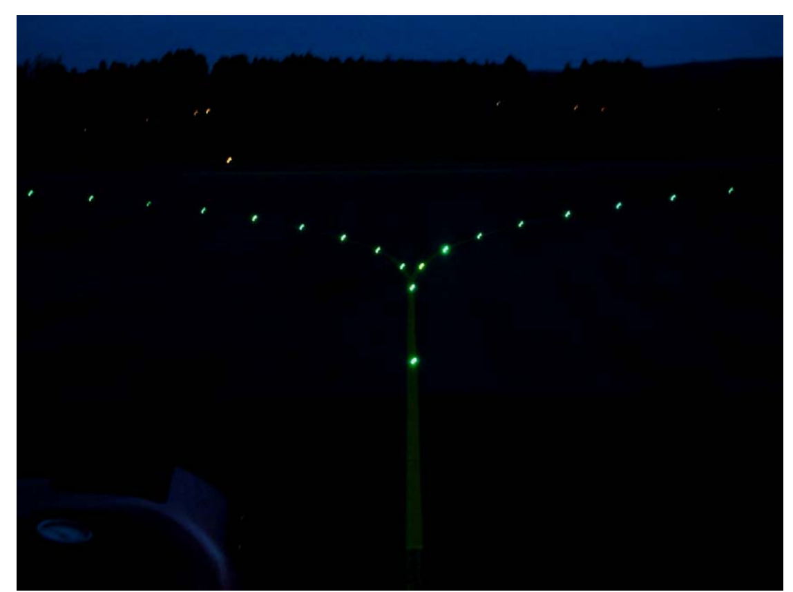
On TWY A3 at the holding point for RWY 01L.