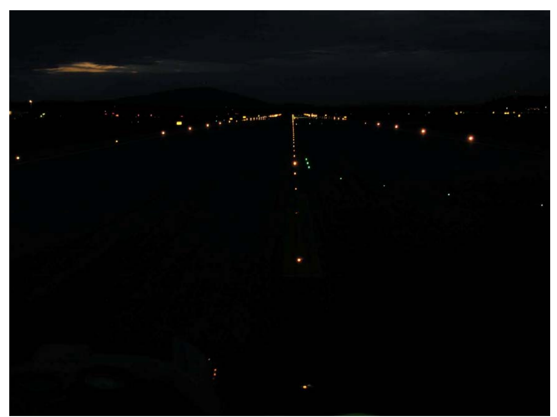
On RWY 01L at intersection TWY A3.