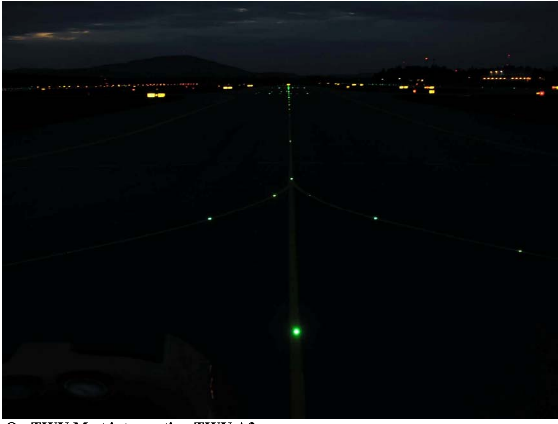
On TWY M at intersection TWY A3.