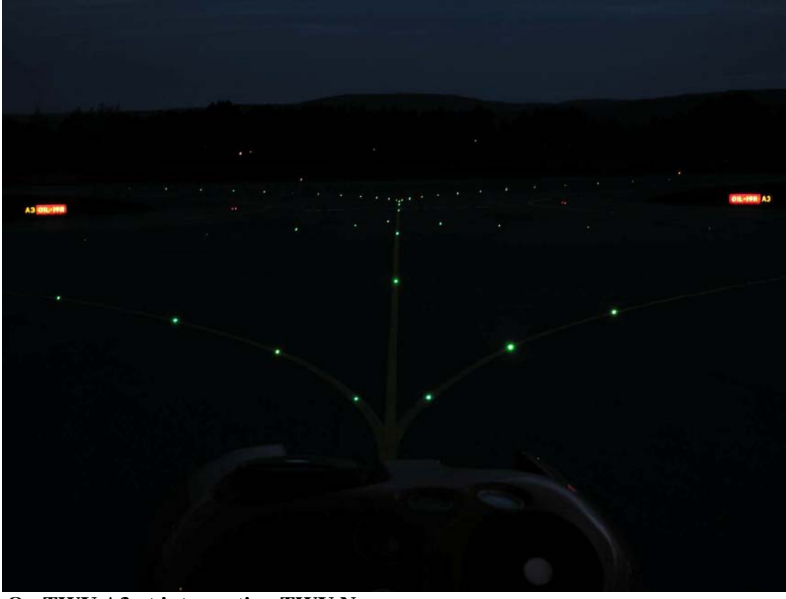
On TWY A3 at intersection TWY N.