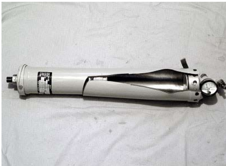
Figure 1 Accumulator as removed from the aircraft

The pressure cylinders are machined from solid cylindrical steel bar stock of material specification S98 or similar and have a wall thickness of 2.8 mm. The manufacturer's job card specified fluorescent magnetic particle inspection of the cylinder in both longitudinal and circumferential directions to detect for cracks. The manufacture, surface treatment and crack detection of the cylinder were all subcontracted out by the