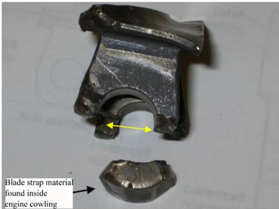
Blade strap material found inside engine cowling