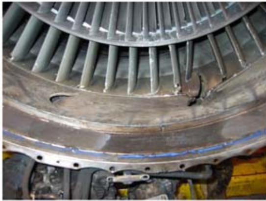
Second stage assembly removed - casing penetrations at 5-7 o'clock positions

The penetration marks on the fan case were consistent with fan blade release kinematics. The initial blade tip impact was in the plane of rotation and the impact of the blade root was aft of the plane of rotation. Both impacts tore the containment case. It is probable that no significant material exited through these penetrations as only one piece of blade strap material was recovered from inside the cowling. There was no evidence of cowl penetration.