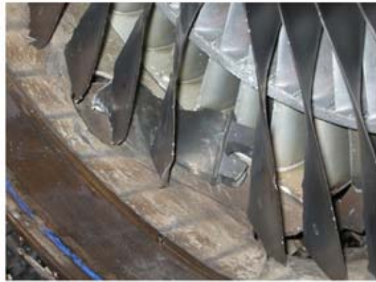
Second stage fan assembly - 'as found' position of detached blade