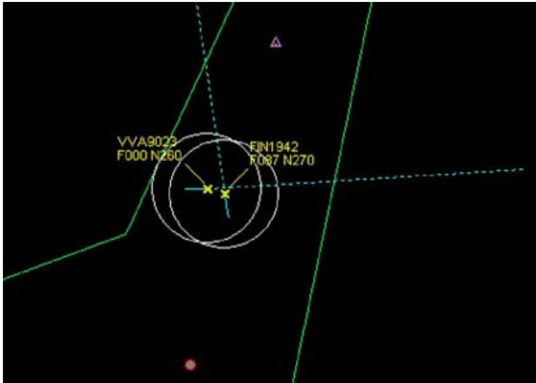
Picture 3. The positions and C-mode altitudes of the aircraft at the passing moment

VVA9023 disappeared for approximately 20 seconds from radar screen. When the altitude indication resumed, the aircraft was at flight level 70. The reason for altitude indication disappearance could not be solved during the investigation. Possible reasons could be either communication interruption between the transponder of VVA9023 and SSR radar or that the transponder of VVA9023 did not send the C-mode information at that time.