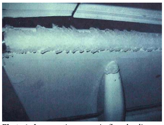
Photo 1. Ice accretion on main flaps leading edges from a December 1998 A321 event

In December 1998, two similar events occurred involving a foreign carrier's A321 aircraft landing in CONFIG FULL in icing conditions. The roll oscillations were attributed to ice accretion, particularly on the flap leading edges, affecting the slot between the main flaps and wing box. Because the main flaps are similar on the A320 and A321, and no events of this nature were ever reported on the A320, the icing conditions were considered to have caused the events and no changes to the